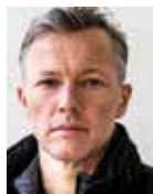
Matthew Desmond POVERTY, BY AMERICA January 19