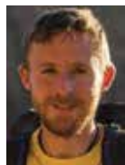
Tommy Caldwell ROUTE FINDING FOR SUCCESS January 25