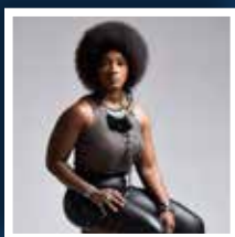
Dogwood Center Events Page 2