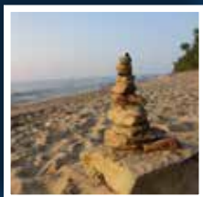
Exhibits Page 8