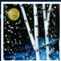
Art Classes Page 12